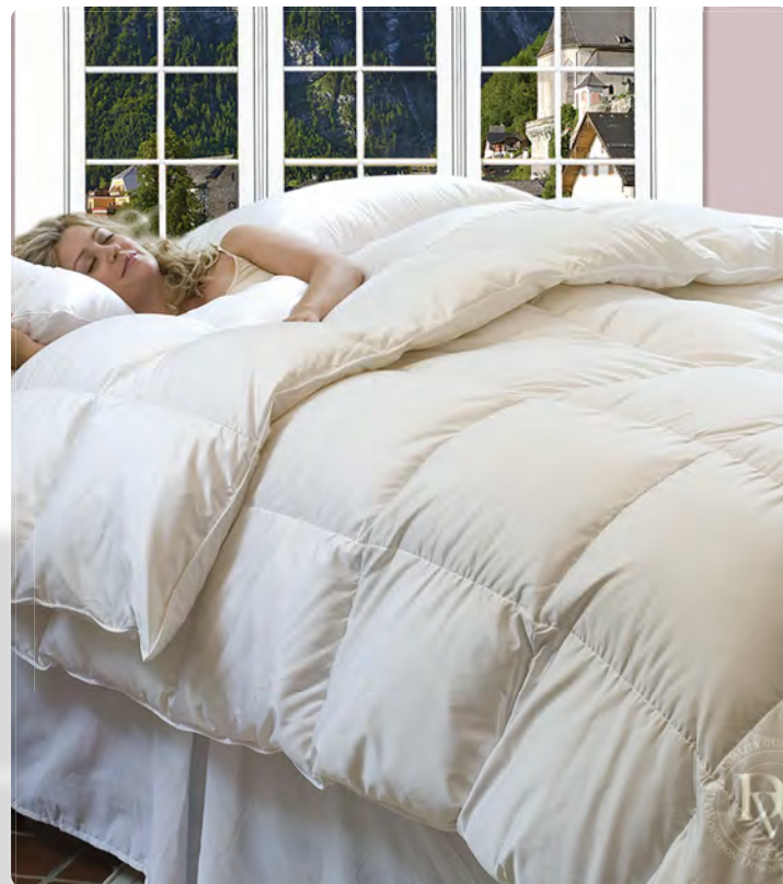
Mountain Air weight shown

The fabric covering this comforter is woven in Austria by a mill experienced in producing downproof fabrics for over 100 years. This very special downproof fabric has an invisible aloe vera finish that is anti-microbial and prevents yellowing and retards aging.