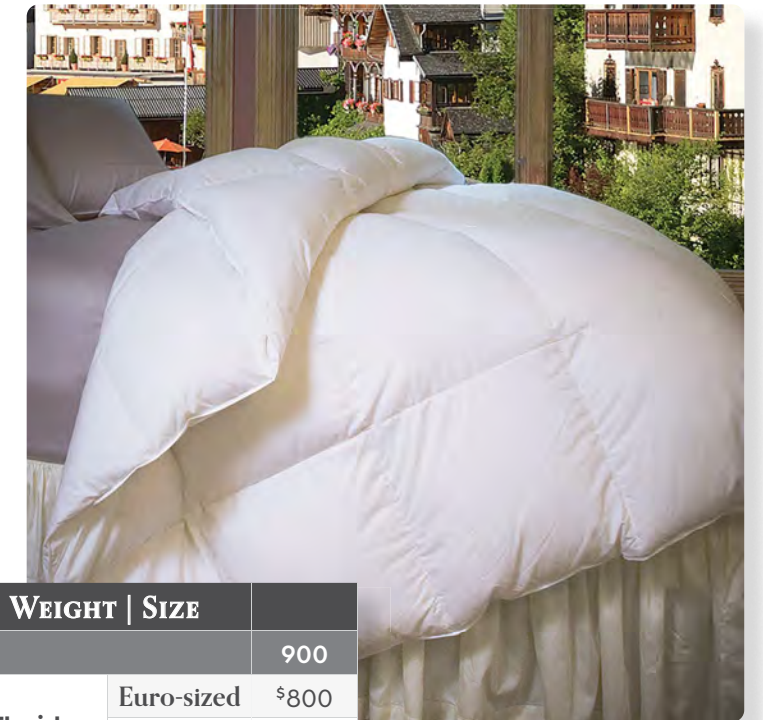
Carolina Piedmont weight shown

Our Austrian Tencel™ Batiste down comforter is DEWOOLFSON's finest. The fabric is a tightly woven blend of cotton and natural Tencel™ lyocell yarns woven in Austria by a mill experienced in producing downproof textiles for over 100 years. This unique blend of fibers feels very much like silk. The Tencel™ yarns are a natural cellulose fiber made from beechwood that absorbs body humidity at night and quickly releases it in the morning. Austrian Tencel™ Batiste comforters are filled with our exceptional – and rare – responsibly sourced, all European 900 fill power white goose down.