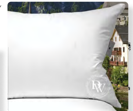
See our pillow catalog