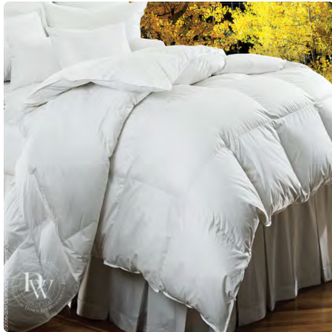
Carolina Piedmont weight shown

This is our most popular comforter – made with the same densely woven, German-engineered downproof fabric that we have used and trusted for over 35 years. It is one of the most widely used downproof cambric cotton fabrics in Germany and throughout Europe.