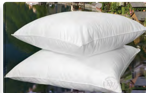
See our pillow catalog